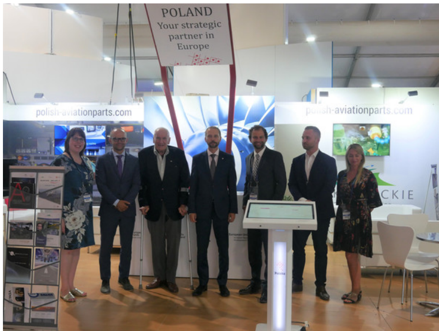
A visit of diplomats at the PAIH stand