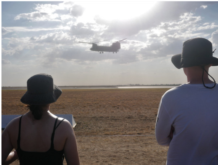
Air show during the fair

The International Airshow and Aerospace & Defense Exposition fairs were held at the Avalon airport from 26 February to 3 March. With the support of Australian government agencies and a number of civil sector entities, fair organizers invited international leaders in the field of acquisition of defense equipment, civil air transport, air traffic control, passenger aviation, commercial aviation and aviation technology with special emphasis on Asia and Pacific region.